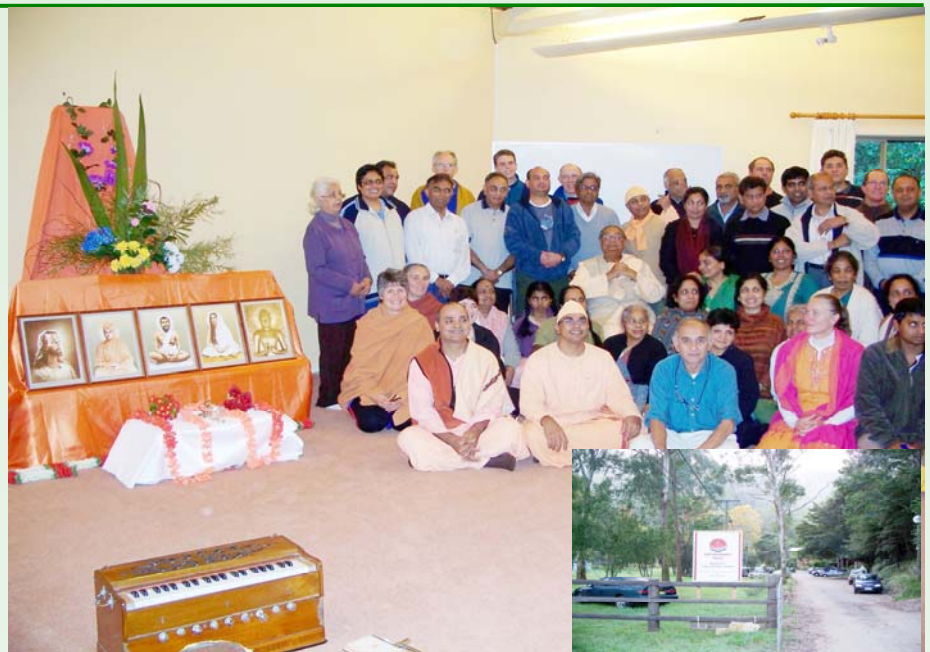
Group Photo at the Retreat Inset: The Satyananda Yoga Centre

Guru Purnima was observed on 29th July at 6:30 p.m. The programme consisted of worship, singing devotional songs, readings from selected portions of the sayings of the disciples of Sri Ramakrishna depicting the importance of Guru. The functions were well attended and prasād was distributed to devotees after the programmes.