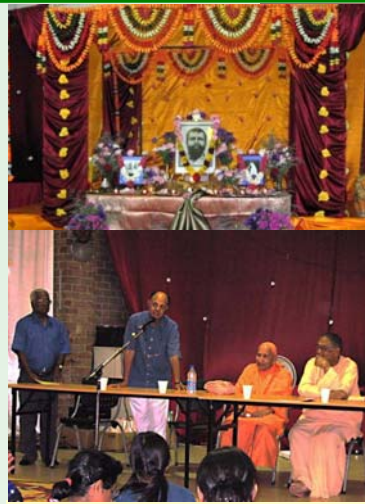
Public meeting in Perth