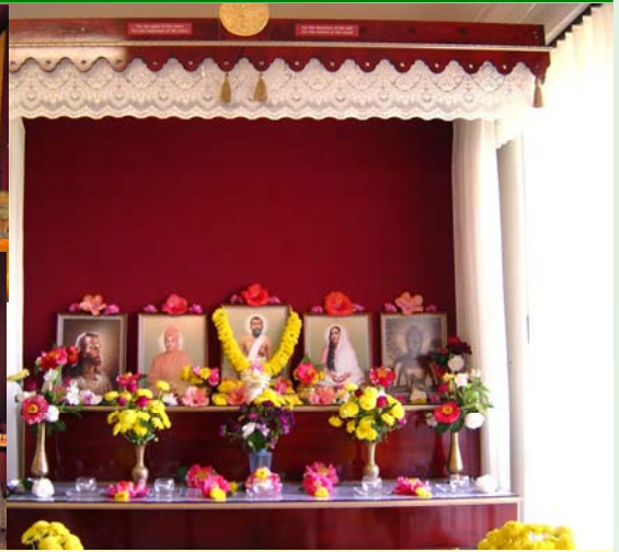
Shrine at Perth Centre

Every Saturday the Bala Bodhi evening classes for children and youth is being conducted from 4:00 p.m. to 5:00 p.m. On Sundays, satsangs for the devotees start at 11:00 a.m. followed by a simple lunch- prasada for all. Swami Damodaranandaji meets the devotees and the visitors, and, on invitation, delivers talks at various places in Perth. Contacts: Centre 08 9313