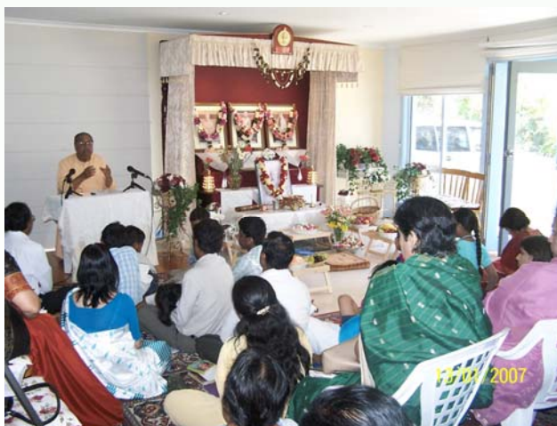
Birthday Celebration of Swami Vivekananda at Melbourne Centre